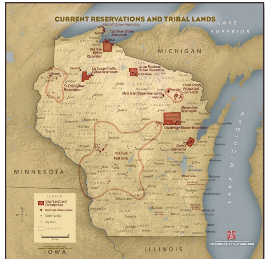
Figure 2. Current Reservations and Tribal Lands in Wisconsin