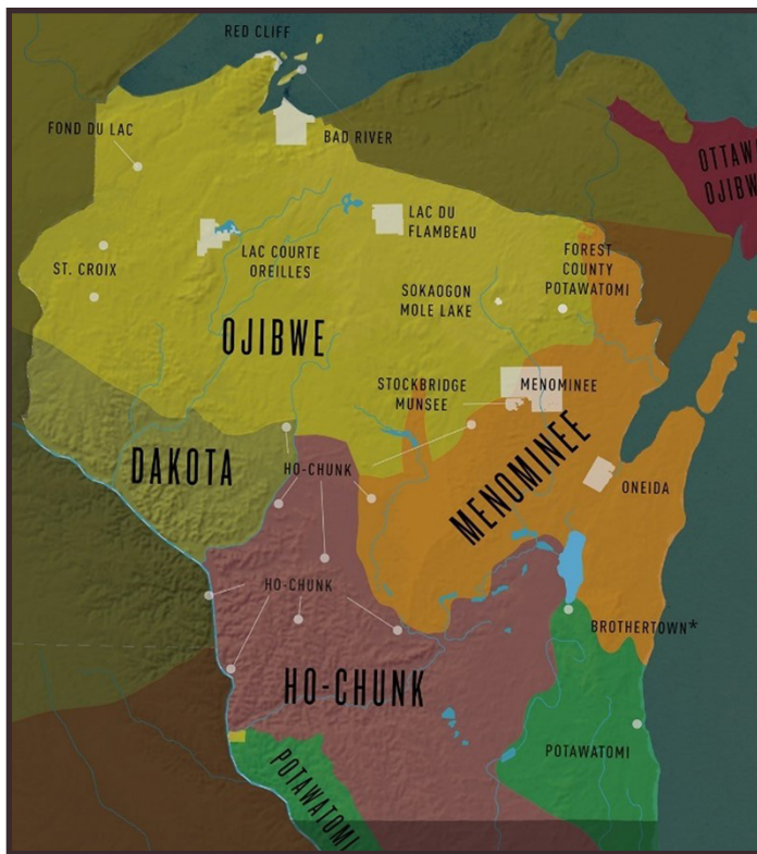
Figure 1. Historical Tribal Lands of Wisconsin

The Tribes of present-day Wisconsin are descendants of peoples who lived on and cared for this land long before the arrival of Europeans. The Menominee, Ojibwe, Potawatomi, and Ho-Chunk people are among the original inhabitants of Wisconsin, while the Mohicans and the Oneida moved to Wisconsin following removal from their ancestral lands.